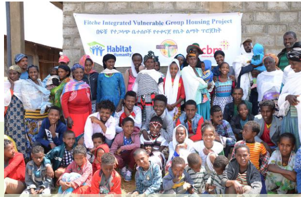
Families after moving to new houses