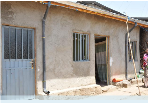
Housing component of Urban Slum Upgrading Project