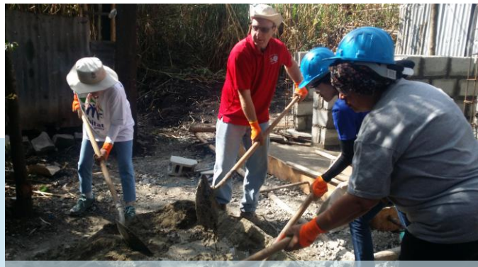
AP Area Office staff and local volunteers on Habitat site