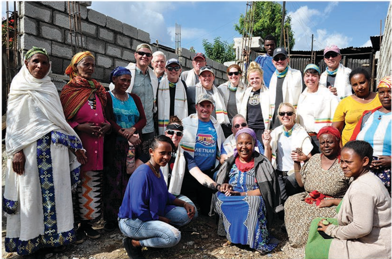
A team from Twin Cities HFH with families after construction work in Addis Ababa, November 2019