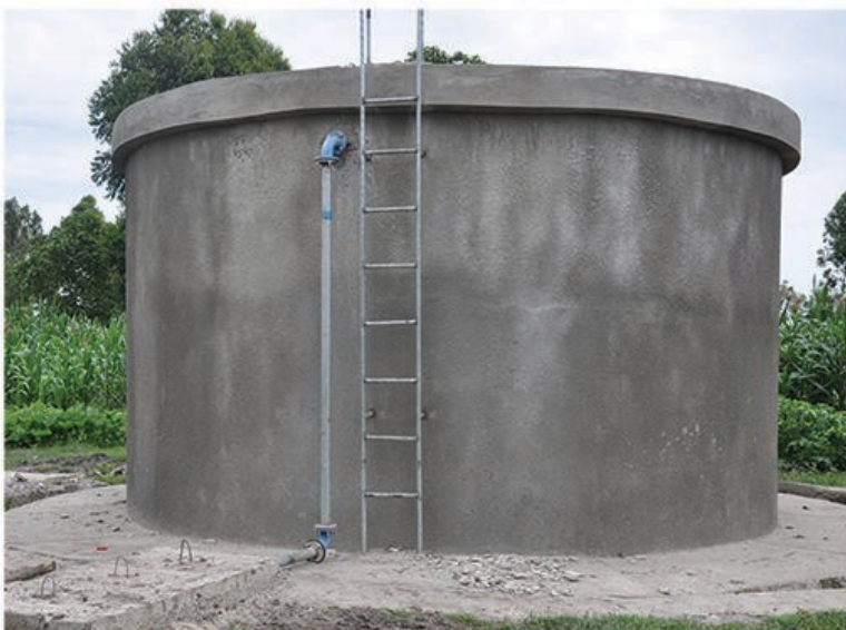
A reservoir for communal water service!

Habitat Ethiopia also partners with schools to improve sanitation facilities for students and enhance hygiene awareness. Since July 2019, 6660 families get access to safe water and nonfood items, and 151 individuals received capacity building training.