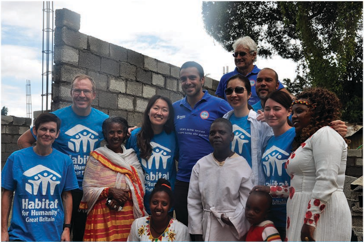
Donors' team from HFH Great Britain with family members in Addis Ababa, October 2019