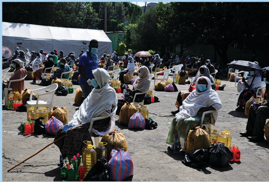
Families ready to receive items

Habitat Ethiopia established a task force which work with all staff, facilitate delivery of sanitary kits, provide training to staff, share updated information on daily basis through WhatsApp. The task force also outlines scenarios based on the changing status COVID-19 and recommends actions items which help protect staff from the pandemic.