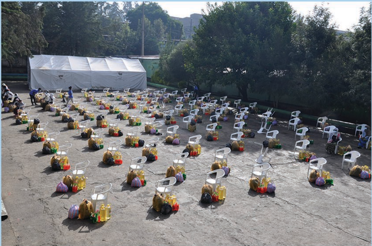
Items ready for distribution