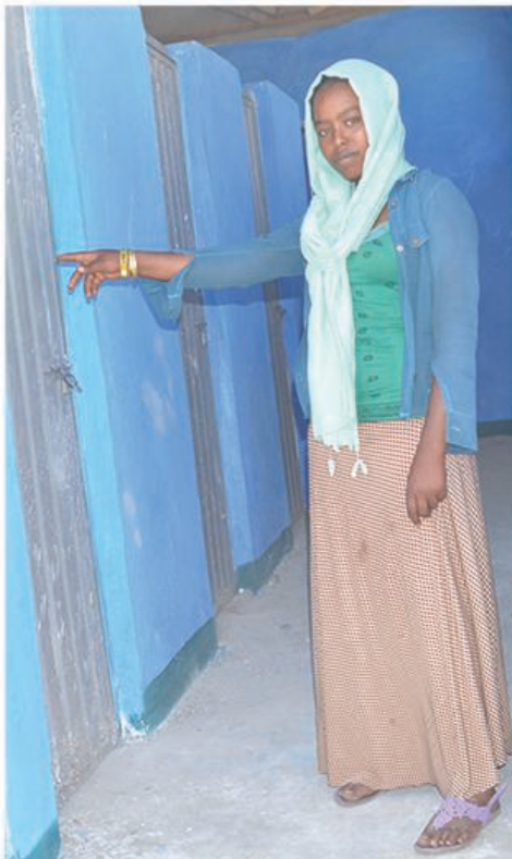
Hasha paused at new school toilet

Students at Sayo Laga school in Negele Arsi district expressed joy at school toilet constructed by Habitat Ethiopia. Before the new toilet started service in April 2019, the students face severe problem while they stay at school. Few students used small pit latrine covered with corrugated iron sheet, which was unsafe and not comfortable for privacy. Male students were forced to go to fields and girls must wait until they arrive homes as they could not use open fields. Lack of toilets, water and menstrual kits in the rural district is the critical challenge for female students. Many girls do not go to school and female' dropouts are high in Negele Arsi and other districts. Through DR3-WASH Resilience building Project Habtiat Ethiopia constructed separate toilets for boys and girls at Sayo Laga and other schools.