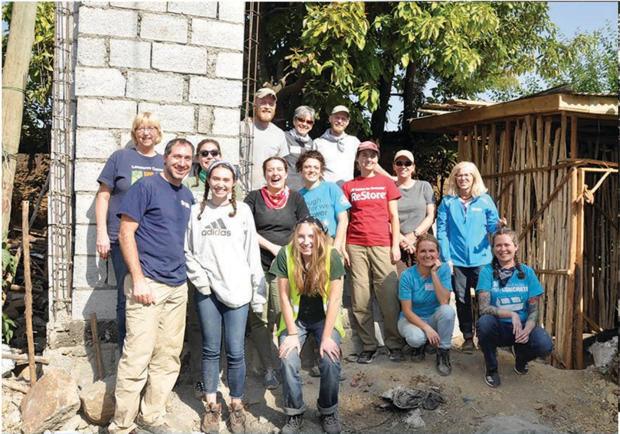
HFH Portland Metro East team after build in Addis Ababa, January 2020